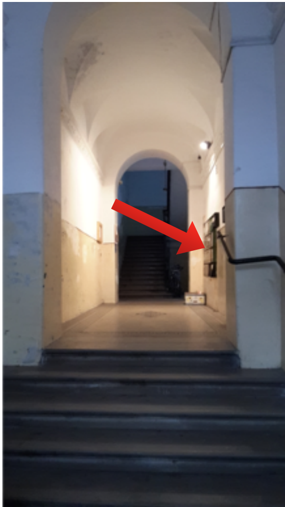
The postboxes are on the right after some steps.