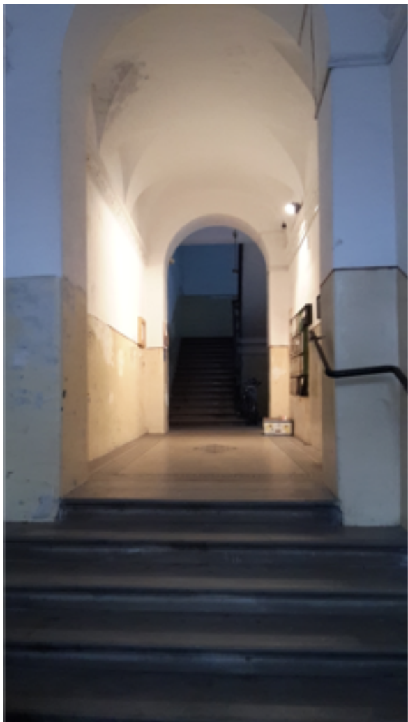
The stairs are straight ahead and the apartment is on the 2nd floor.